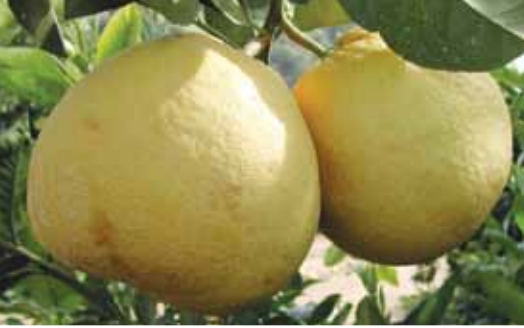
The cholesterol-lowering pomelit fruit.