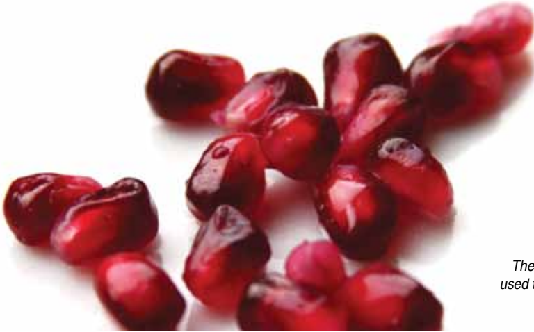
The pomegranate is used to promote heart health.