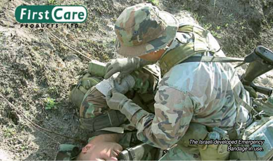
The Israeli-developed Emergency Bandage in use.