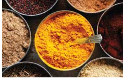
Turmeric helps protect crops from pests.